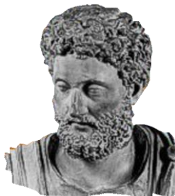
Marcus Aurelius 121 - 180 a.C.